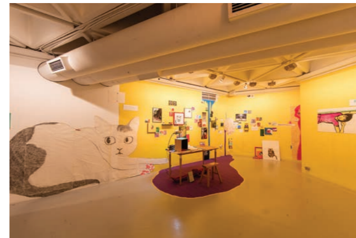
► Haven't We Met Today? (detail) – partial view 2016, Giclee print on water colour paper, 200cm x 600cm by Darky Lee, Master of Fine Art graduate