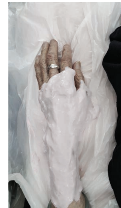
◀ Grandma Hand 2015, Photographic documentation, 72cm x 40cm by Chi Wong, Master of Fine Art graduate