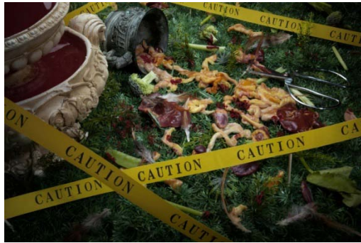
SO Wing Hon (Major: Photography)