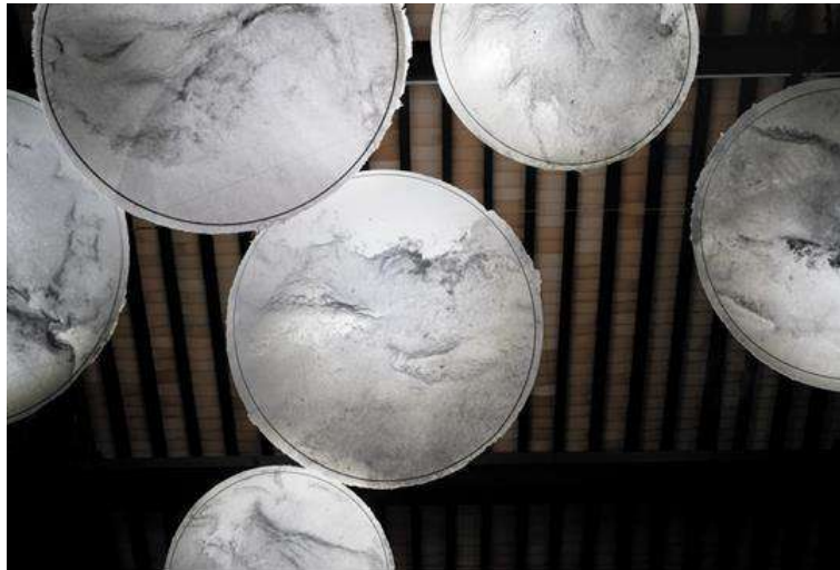
Cordelia Tam Installation view of Effortless Flow (2019) handmade paper, LED light, dried paper pulp and metal plate with Chinese ink / Dimensions variable

Cordelia Tam's sculpture and installation uses papermaking techniques and is informed by the notion of wu wei in Taoism.