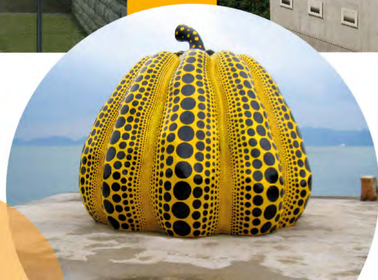
Pumpkin , 1994 by Yayoi Kusama Naoshima

Direct & Exclusive Interaction with the Artists, who are also our Lecturers and Alumni, in the Setouchi Triennale!