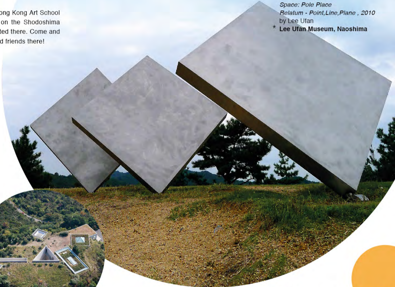
Three Squares Vertical Diagonal , 1972-82 by George Rickey Naoshima