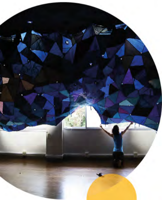
Fukutake House 2013, Shodoshima