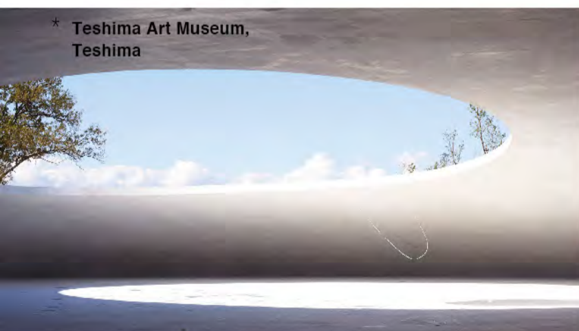
* Teshima Art Museum, Teshima