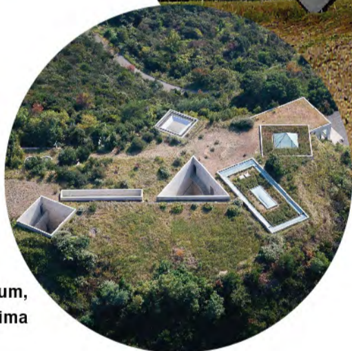
* Chichu Art Museum, Naoshima