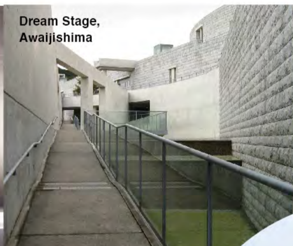
Dream Stage, Awajishima