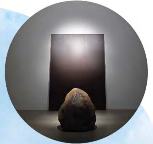
Space: Pole Place Relatum - Point, Line, Plane , 2010 by Lee Ufan * Lee Ufan Museum, Naoshima

This year, Artist-Lecturers and Artist-Alumni of Hong Kong Art School again take part in the Fukutake House project on the Shodoshima 小豆島 and have their artworks exclusively exhibited there. Come and have a direct exploration of art with our artists and friends there!